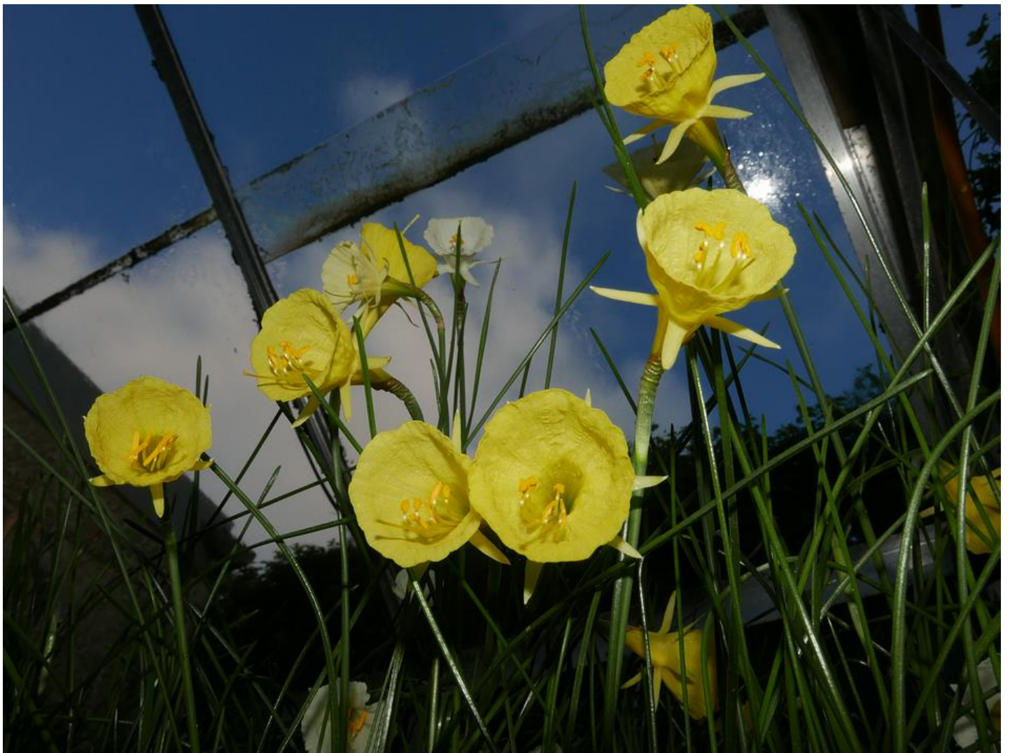
As some of the earlier predominantly white flowered Narcissus start to fade it is the turn of yellow flowered forms to take the stage – these are a mixture of Narcissus bulbocodium and romieuxii as well as a number of hybrids.