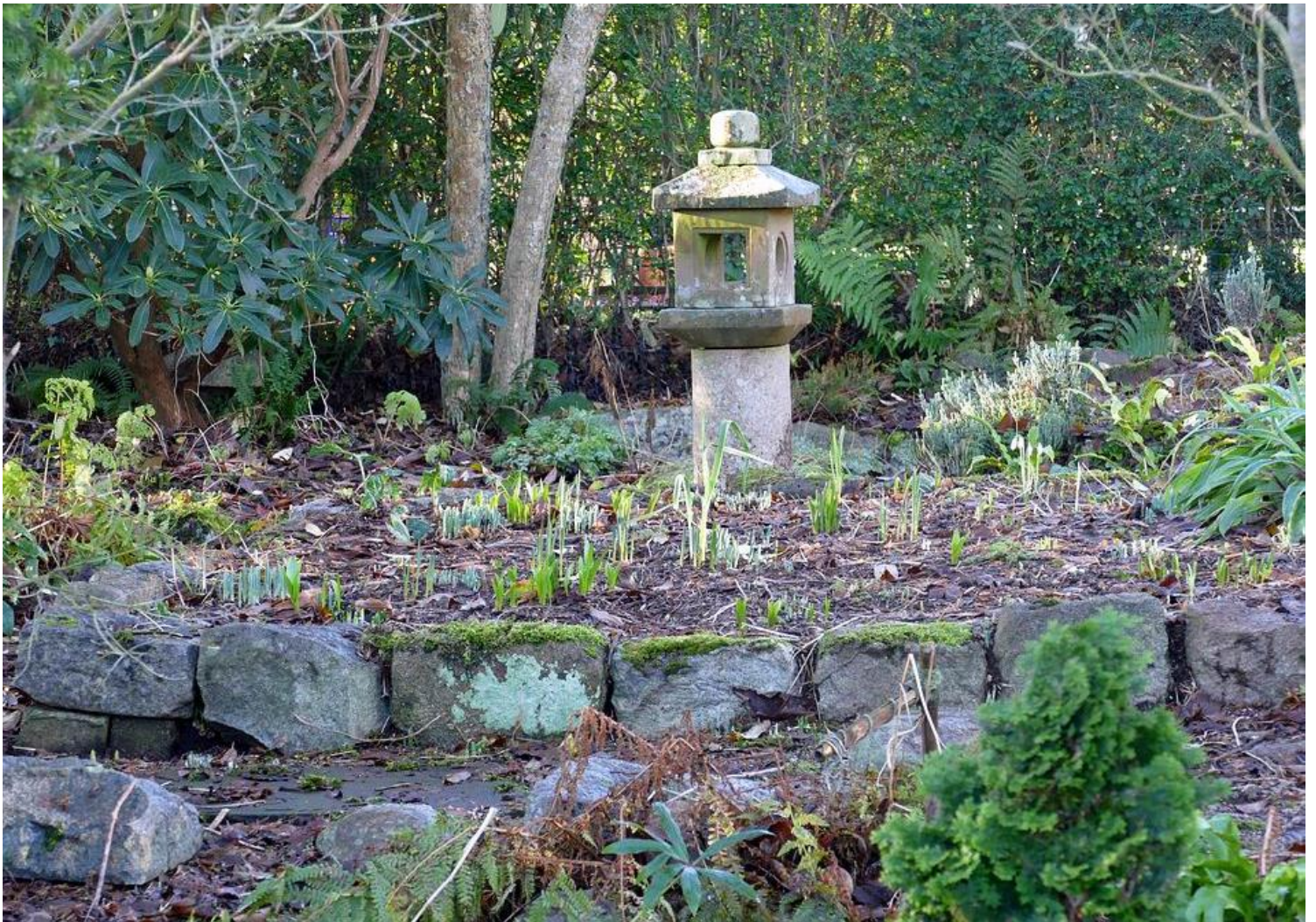
Looking across to the bulb bed I can see there are many shoots suggesting it will not be long before we get flowers.