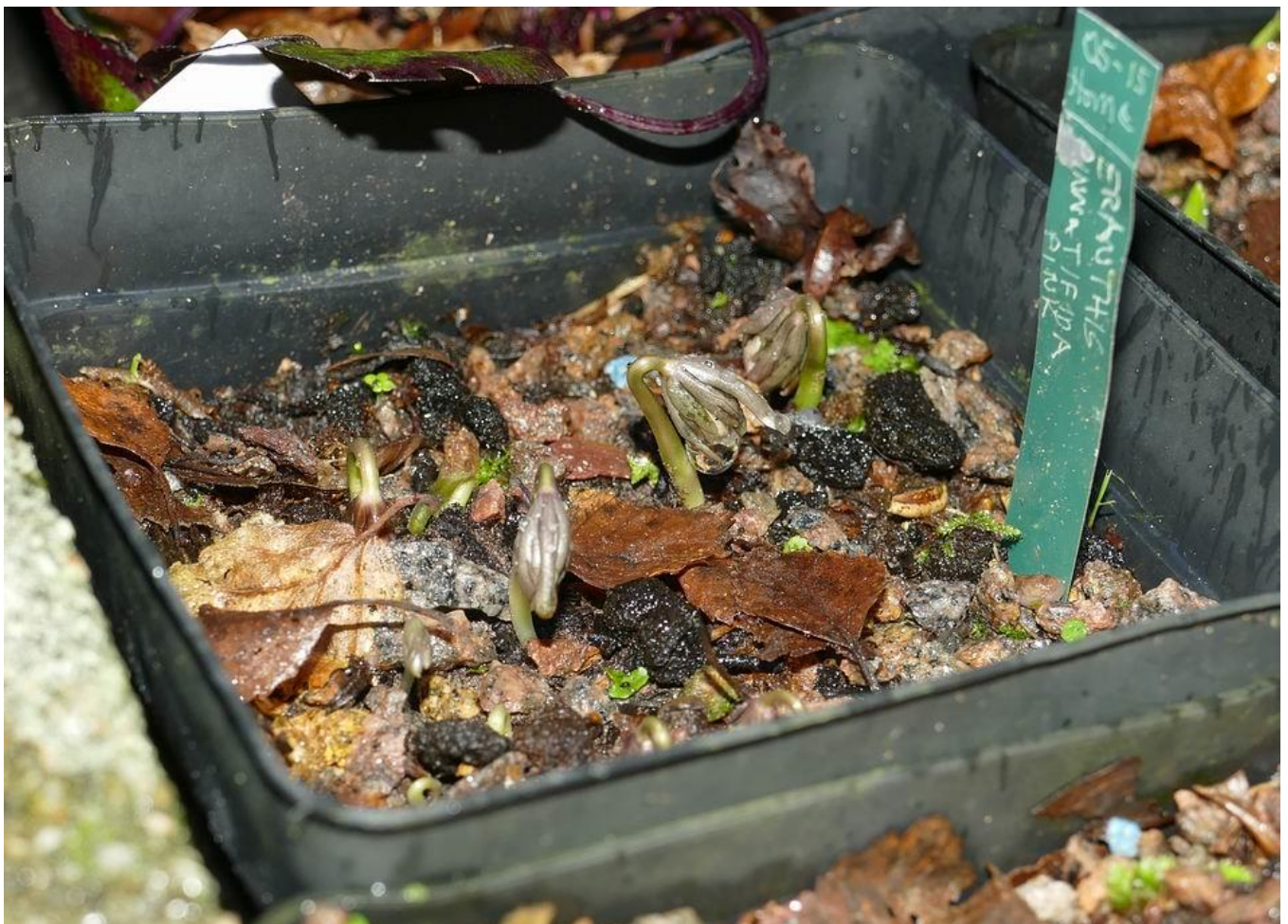
Eranthis pinnatifida is coming into growth in an outside frame even though the pot is frozen solid.

have also evolved this trait so as not to have all their eggs in one basket. If the weather was to turn inclement when the seed was germinating then all could be lost so there is an evolutionary advantage for the seed to germinate over more than one season offering a better chance of survival.