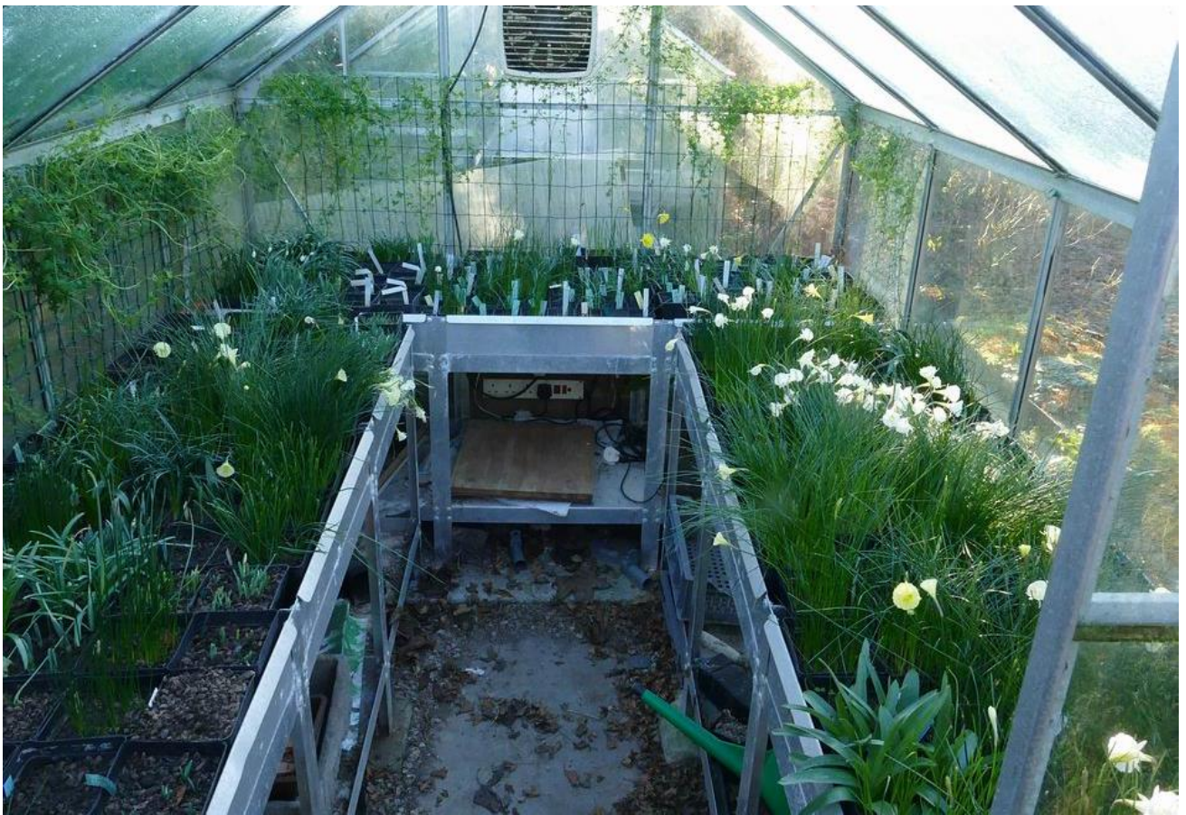
We still have one bulb house where we still grow all the bulbs in pots.