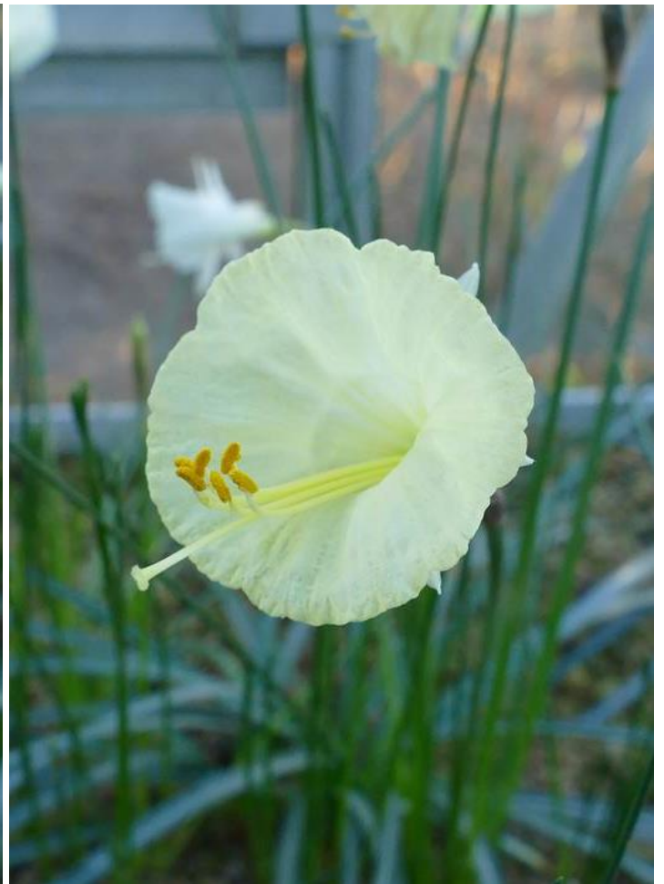
Two variations of Narcissus romieuxii.