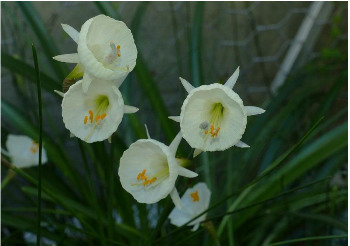
Often the first point of attack for the mould is on the pollen as seen on these Narcissus 'Craigton Chalice' flowers.