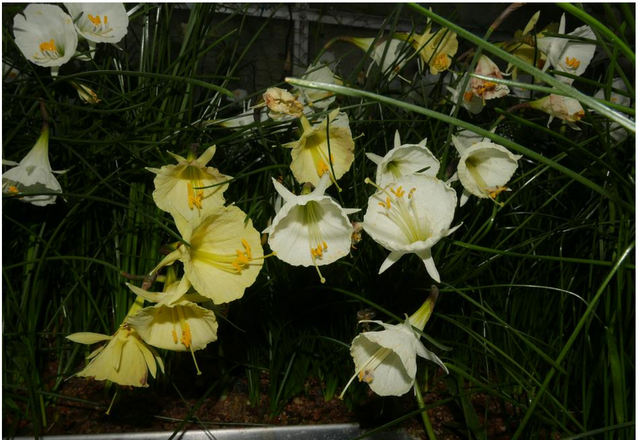
Mixed species and hybrids.