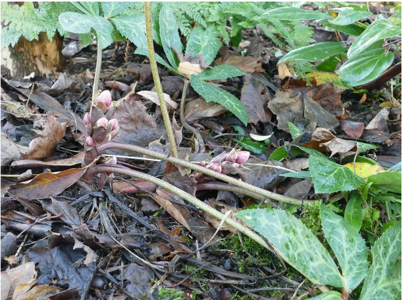
Helleborus x ericsmithii