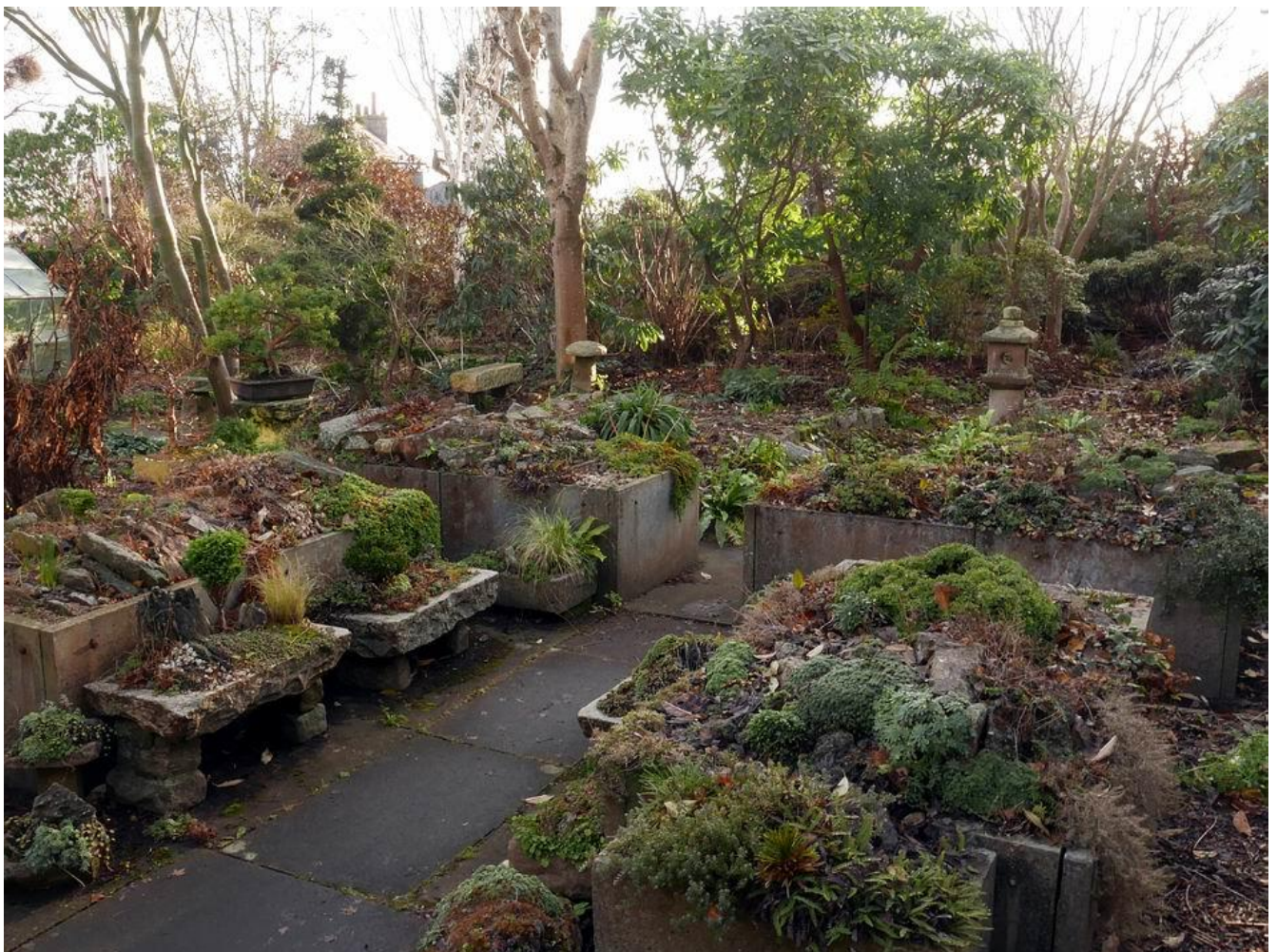
Last week I uploaded a new Bulb Log Video Diary Supplement looking at the garden and the bulb houses in mid-winter click the link to view.....