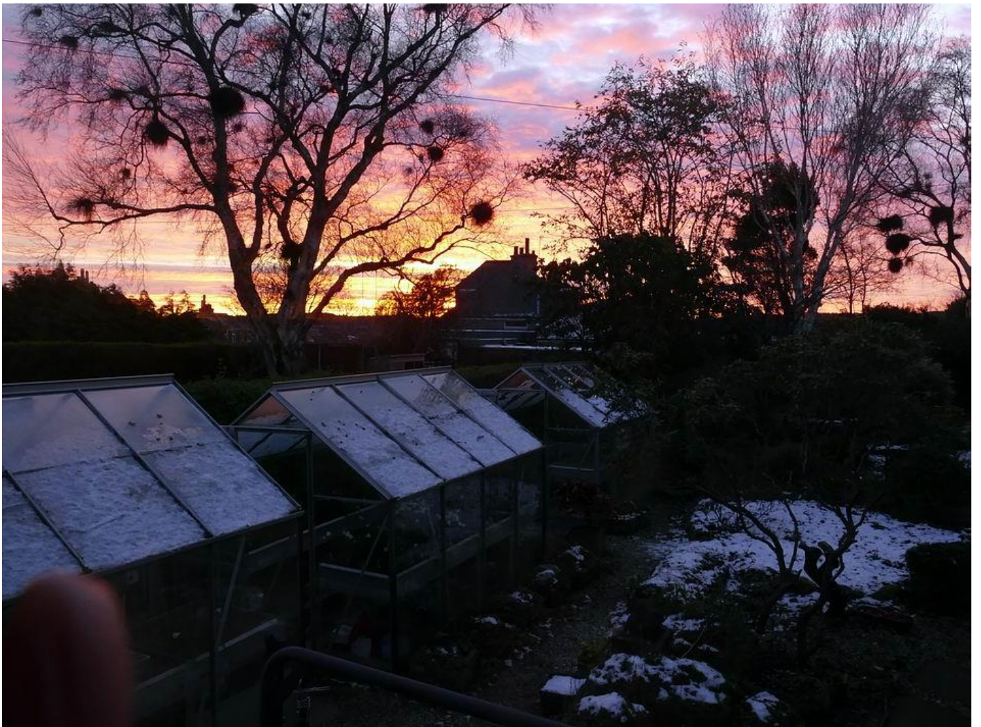
Some mornings just before the sun rises the warm light illuminates the clouds filling the sky above the bulb houses with beautiful colours but the display does not last very long, it disappears when the sun appears.