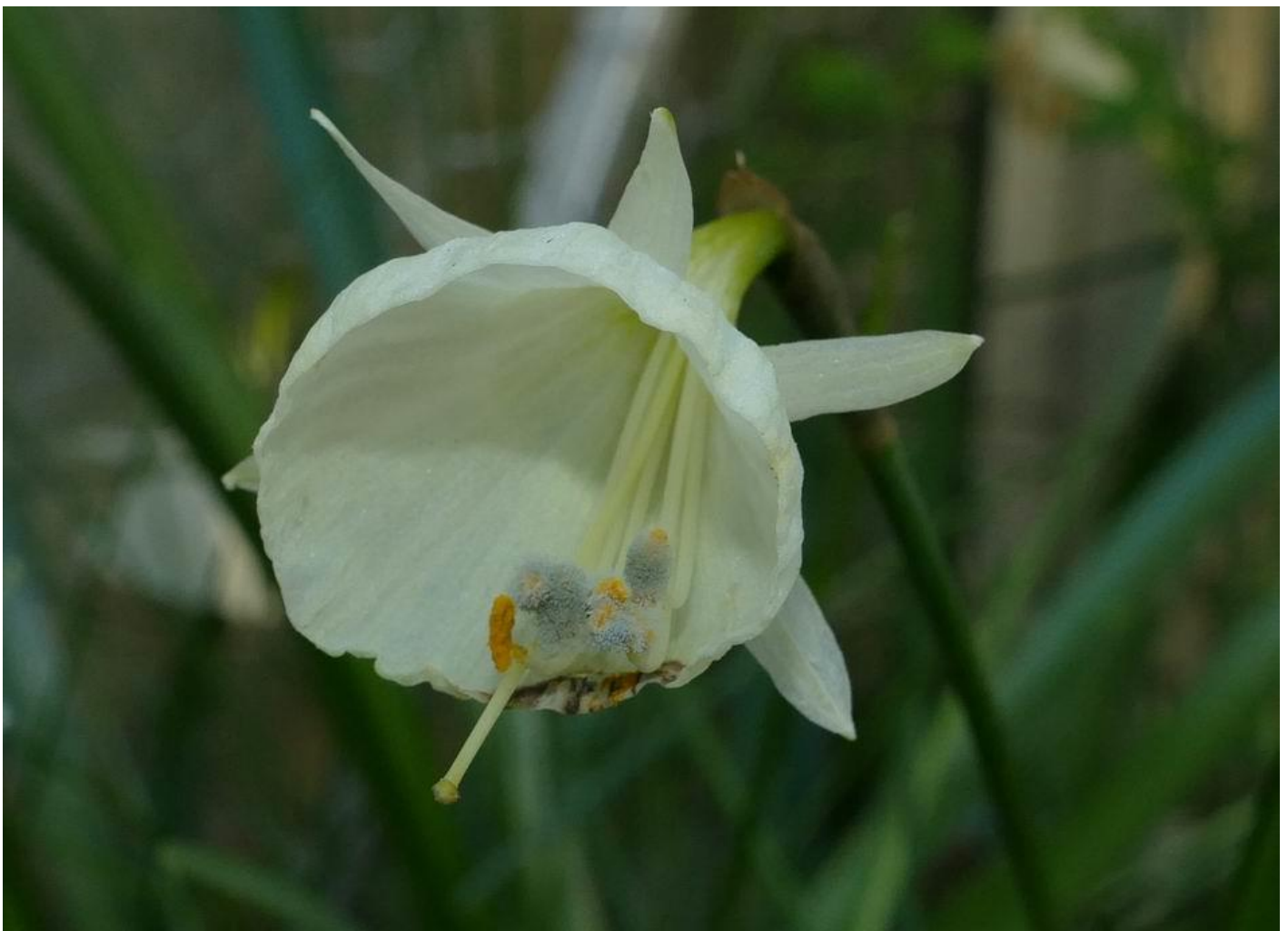
From the pollen the grey mould transfers to the corona so I will remove the flower.