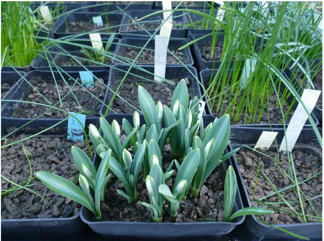
Galanthus 'E. A. Bowles'

When we first get a special Galanthus we will grow them in pots until we have sufficient numbers to test their hardiness planted out in the open garden.