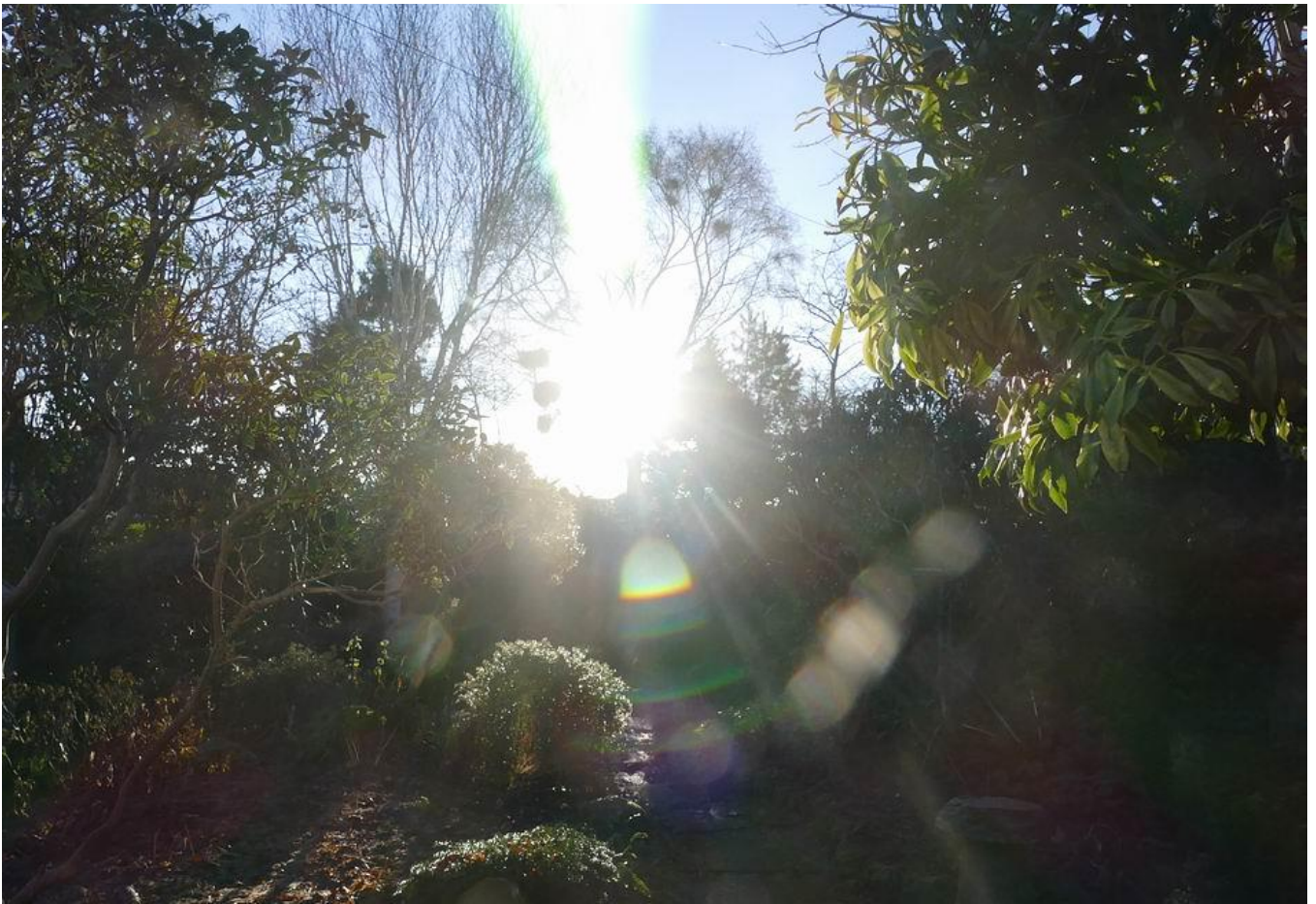
The days are at their shortest just now this picture shows the highest point that the sun reached on that day it will slowly get higher as the planet tilts towards it and the days start to lengthen.