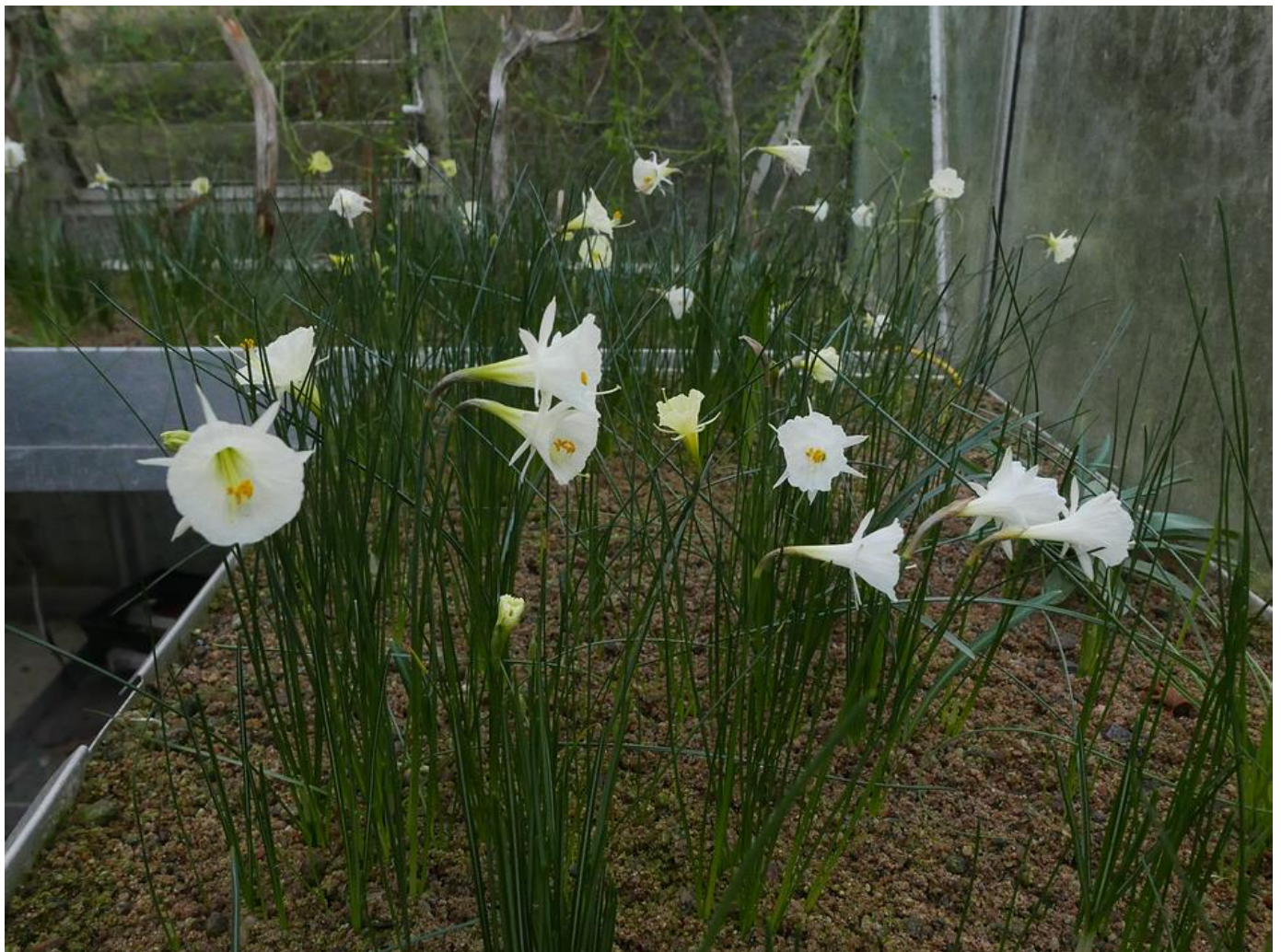
Most of the Narcissus in these sand beds are our own seedlings which were open pollinated so are of mixed parentage.