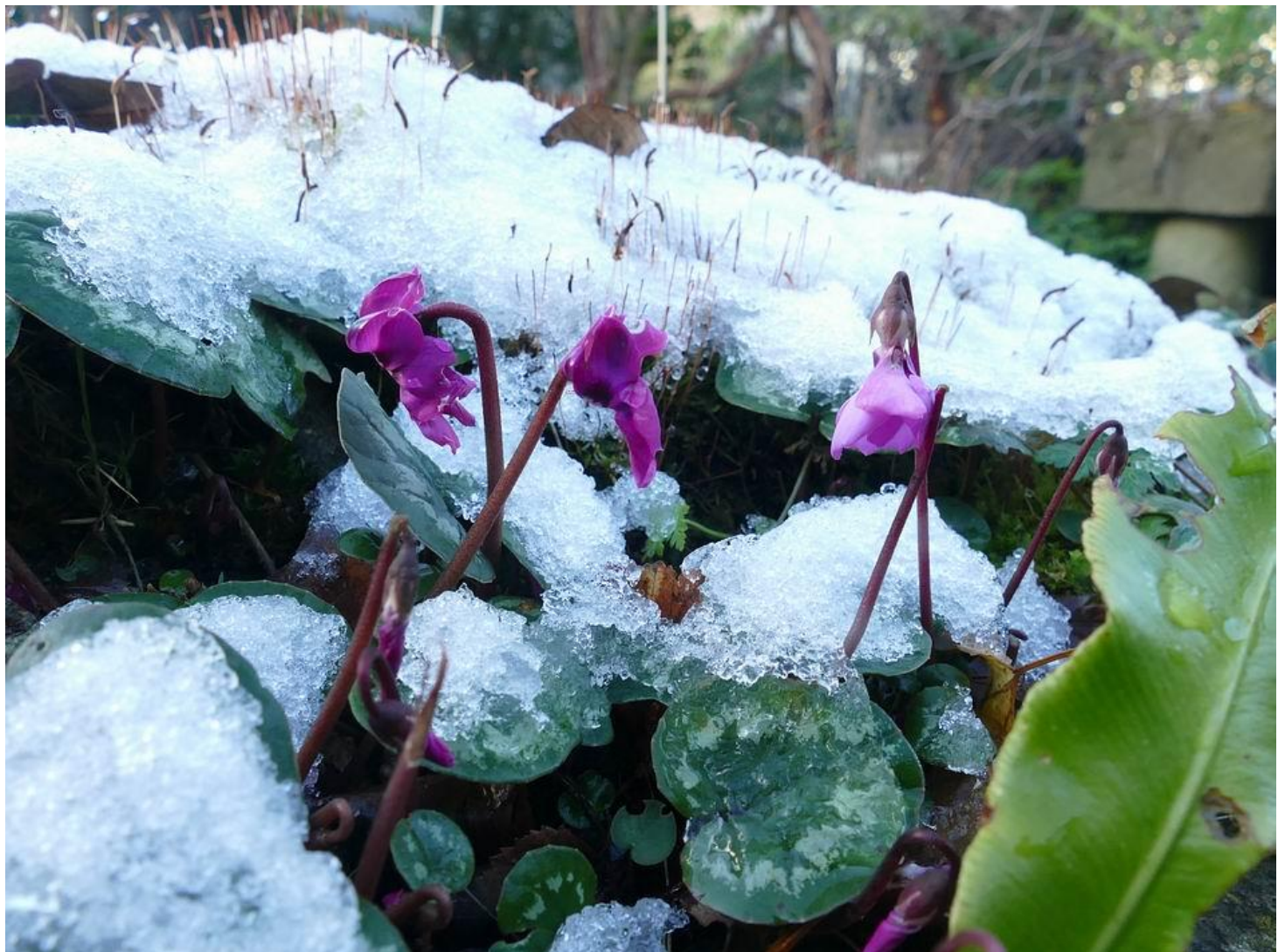
The first few flowers of Cyclamen coum are opening and the other buds will open over the coming months.