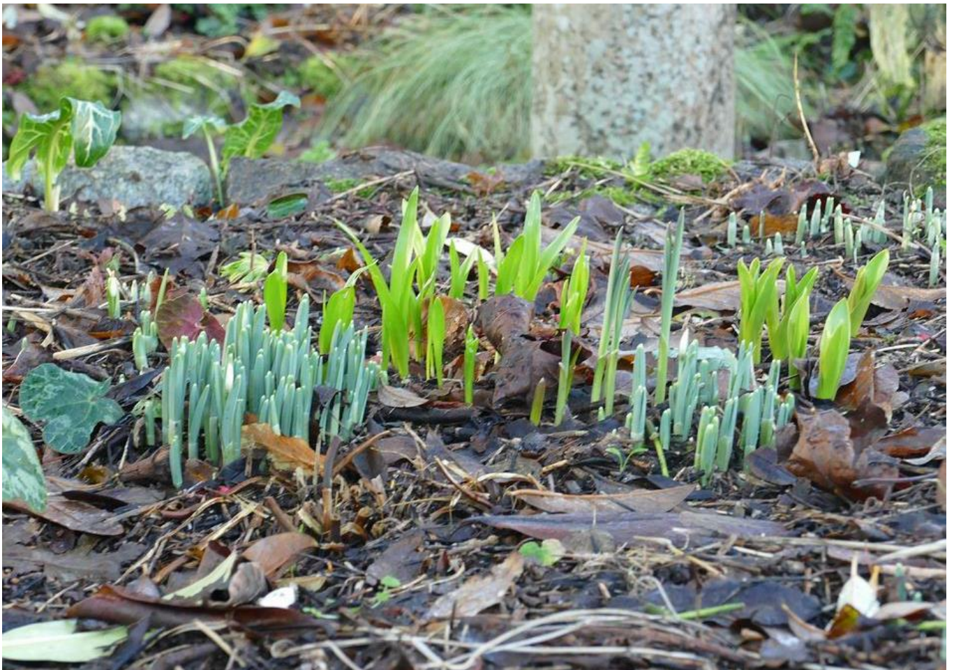
Galanthus and Colchicum are among the bulbs in growth.