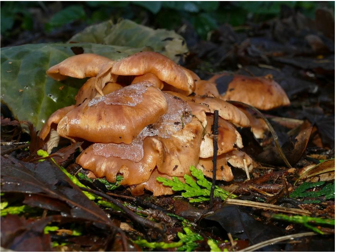
Winter fungi with an icecap.